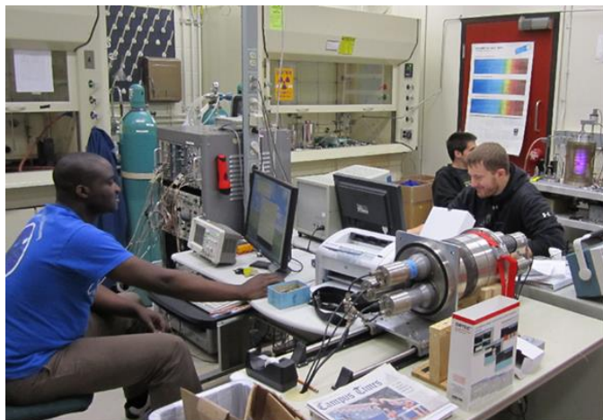
Nuclear Science Group Lab

The Nuclear Science Research Group (NSRG) at the Departments of Chemistry and Physics employs part-time student researchers to help with ongoing experimental R&D: